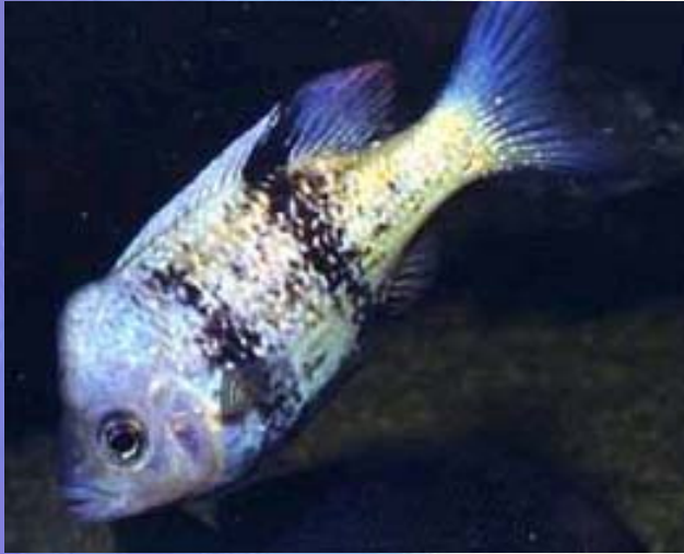
REINTHAL & STIASSNY, 1997